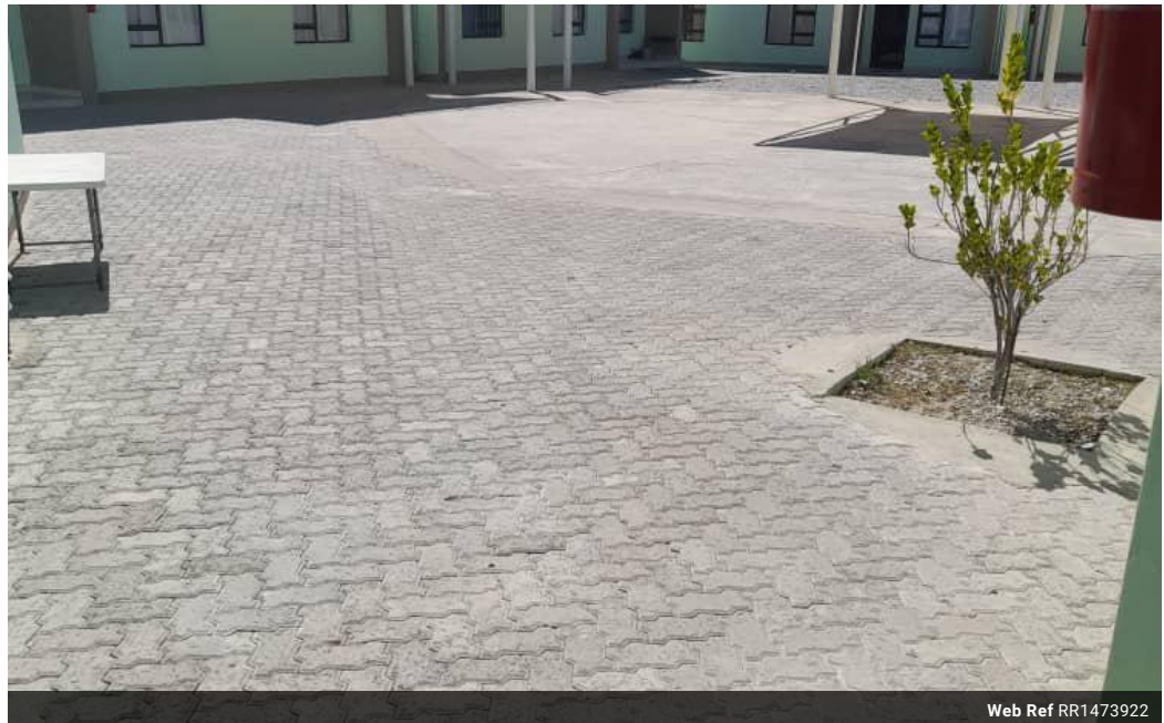
Web Ref RR1473922