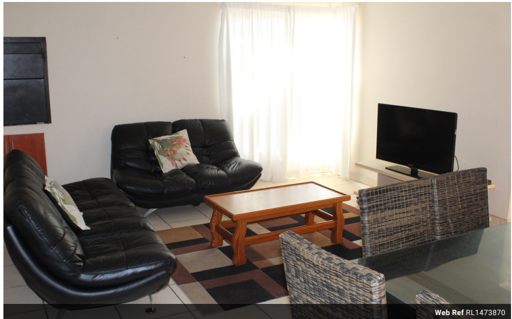
Web Ref RL1473870